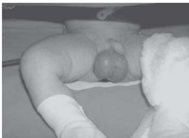
Figure 2. Perinatal testicular torsion with enlarged, bluish right hemiscrotum

All patients underwent inguinal or trans-scrotal exploration of the affected side, and all, but 2 (28.6 %) to whom orchiectomy was done, underwent detorsion of affected testis.