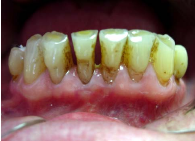
Figure 3. Photograph assists in communication between dentist and patient

The preoperative photograph sent along with the sample of the tissue to the pathologist may render important information, and in this way also help in defining the proper diagnosis (Figure 3).