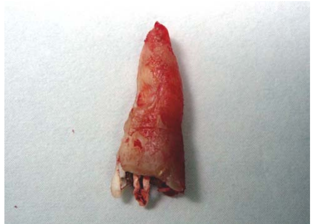
Figure 7. Photographing of interesting cases or curiosities arouses interest in dentistry