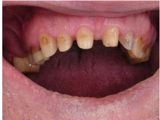
Figure 1. Photograph made before treatment

In many situations, discrepancies between the dentist and patient may also be overcome in this way. In addition, images should be always made after the treatment, the purpose of which is not only to legally