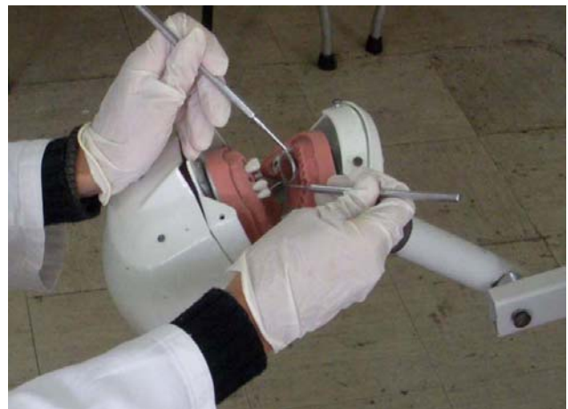
Figure 5. Digital photograph is very useful for illustrating lectures to dentists as well as for lecture writing and publications

exclusive and, as such, quickly understood. Marketing in the positive sense may allow the patient to immediately compare the beginning and outcome of the treatment. Two images, printed next to each other, are generally sufficient for this and can be given to the patient. Very little text is needed. Patients are often prone to show them to friends and people they know. There is probably no better, small but efficient, marketing tool from this (16) (Figure 6).