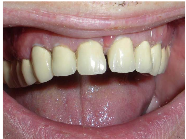
Figure 2. Photograph made after treatment

protect the dentist but the patient as well. Dental photography is also useful in the course of treatment and control check-ups in order to monitor pathological changes on osseous and soft oral tissues. The results of investigations, furthermore, may be documented with the help of images in order to define preliminary diagnoses. Since the importance of dentistry shall be growing in the years to come, the mentioned aspects will have greater importance than earlier (12).