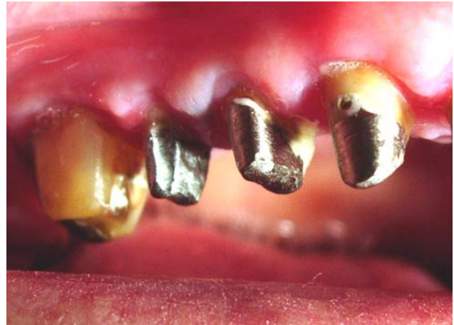
Figure 4. Conditional disadvantage of dental photograph is a possibility of self-checking

The concept of marketing in practice is often misused. Many recommendations by "marketing experts", who call themselves this way, seem to be too