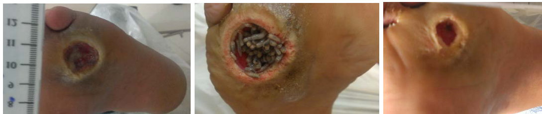
Figure 3. Diabetic foot ulcers in the right leg of a 37-year-old male, which have been treated with two rounds of maggot therapy in ACECR, Tehran, Iran (Original photos)