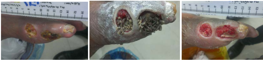
Figure 2. Diabetic foot ulcers in the right leg of a 40-year-old female, which have been treated with three rounds of maggot therapy in ACECR, Tehran, Iran (Original photos)

found variables, ANCOVA analysis confirmed a significant reduction in the size of necrotic tissues and increase in the size of granulation tissues ( p < 0.001 ) (Table 2 and 3). All of the cases were neuropathic diabetic foot ulcer and in their history clearly had the features of hard-to-heal wounds. Photos of four successfully treated cases are shown in Figures 2 - 5 as representative to point out the effectiveness of the new approach of maggot therapy with other routine treatment procedures.