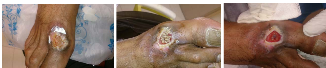
Figure 5. Diabetic foot ulcers in the right leg of a 55-year-old male, which have been treated with one round of maggot therapy in ACECR, Tehran, Iran (Original photos).