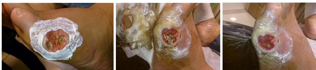
Figure 4. Diabetic foot ulcers in the right leg of a 45-year-old female, which have been treated with two rounds of maggot therapy in ACECR, Tehran, Iran (Original photos)