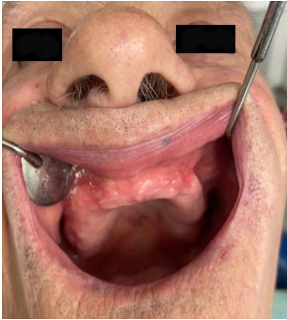
Figure 2. Uneven maxillary alveolar ridge

tion of both upper and lower denture (Figure 2).