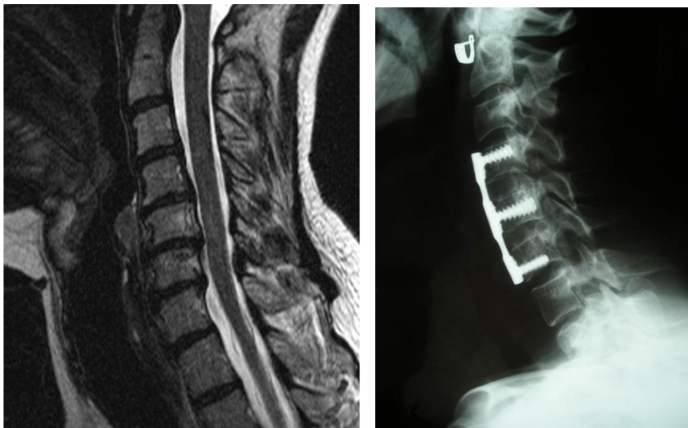
Figure 1. Treatment of two levels / corrected kyphosis