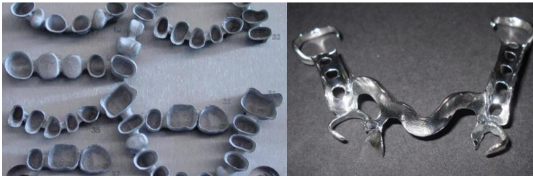
Figure 1. Metal objects obtained by 3D printing

Newer devices allow 3D printing of several types of materials, including metals and non-metals. So Steiner ProX™ 100 Dental system allows direct sintering of metal in order to create high quality metal dentures. This system enables 3D metal printing with obtaining chemically pure, very compact and highly precise parts (EN ISO 2768) with a tolerance of 20 microns in all three axes. It uses more than 15 materials including steel, stainless steel, super alloys, non-ferrous and precious metals as well as alumina (Figure 1.) (3).