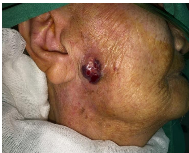
Figure 1. Exulcerated tumor formation in the right parotid region

Anamnestically, the patient had noticed the mentioned tumefaction in the right preauricular region three months before the presentation. The appearance and spontaneous enlargement of the tumefaction did not result in any subjective complaints. The sudden enlargement of the lesion, followed by reduced mouth opening and spontaneous episodes of bleeding from the tumor were the reasons for visiting her oncologist who, after the examination, referred the patient to the Maxillofacial Surgery Clinic.