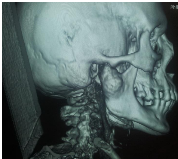
Figure 2. MSCT of the head and neck: an expansive tumor formation in the lower jaw

lowed by hemimandibulectomy with disarticulation of the TMJ (temporomandibular joint), tumor extirpation in the infratemporal fossa, excision of the tumor in the preauricular region, with an adequate reconstruction of the created soft tissue defect with a cervicofacial flap. The post-operative course was uneventful, and the patient was released from the clinic on the tenth postoperative day.