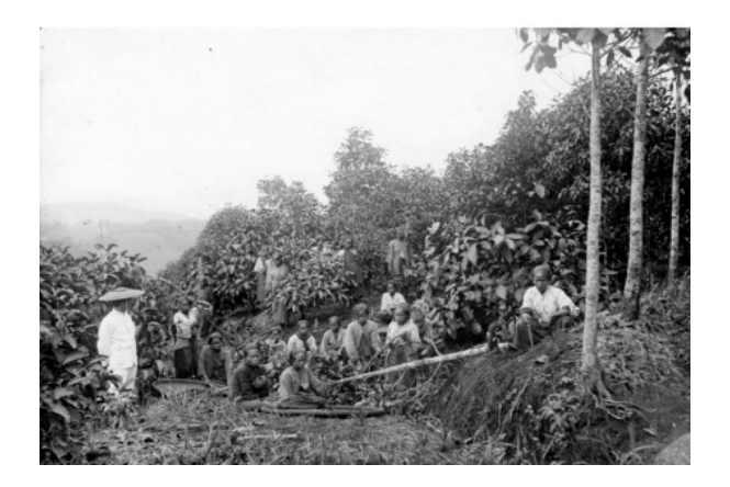
Figure 1. Workers on the Cinchona plantation Ramawatie, West Java. Collection Tropenmuseum, Amsterdam, coll. nr. 10012774. Taken from reference 39

During the period of British colonization of India and other tropical countries, in the early 19th century, medicinal quinine was recommended to British officials and soldiers as a prophylactic against malaria, where it was mixed with soda and sugar to mask its bitter taste, forming tonic water (40).