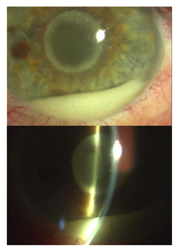
Endoftalmitis in pseudophakic eye

Around 56-90% of bacteria causing acute endophthalmitis are gram-positive, of which the most frequent are Staphylococcus epidermis, Staphylococcus aureus and Streptococcus. Gramnegative bacteria account for 7-29% of endophthalmitis cases, and Proteus aeruginoza and Haemophilus have been reported as the most frequent agents (2,9,12,13).