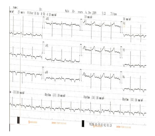
Figure 5. ECG on discharge from hospital