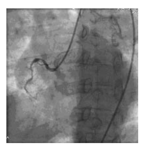
Figure 2. Native RCA