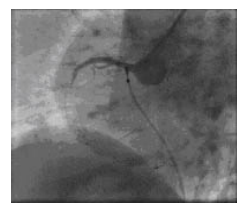
Figure 3. Post stenting no-reflow at RCA