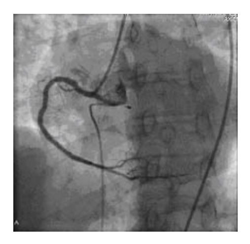
Figure 4. TIMI flow 3 after intracoronary administration of tenecteplase

The patient was transfered to coronary care unit for further monitoring and medical treatment. She was dependent on temporary pacemaker for 6 hours, after that it was removed and the patient was hemodynamic and rhithmically stable. Further treatment include: beta blocker, clopidogrel, aspirin, ACE inhibitor, statin and gastroprotection. Her ECG on discharge from hospital on the 5th day was with negative T waves in inferior leads and biphase T waves in lateral leads (Figure 5).