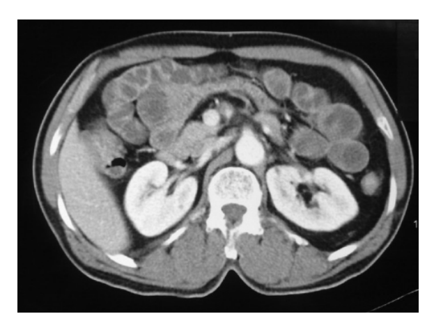
Figure 2. Enhanced abdominal CT scan demonstrates a filling defect in the superior mesenteric artery; enhancement of small bowel wall also present throughout