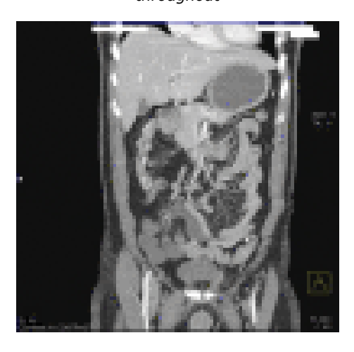
Figure 3. Abdominal CT Angio-coronal recon-structed image revealed marked discrepancy of the bowel wall enhancement between the distal ileum and right colon, and the proximal ileum and left colon, confirming arterial ischemia