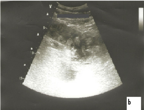
Figure 1. US of abdomen (a,b) shows marked distension of the colon with wall like a paper