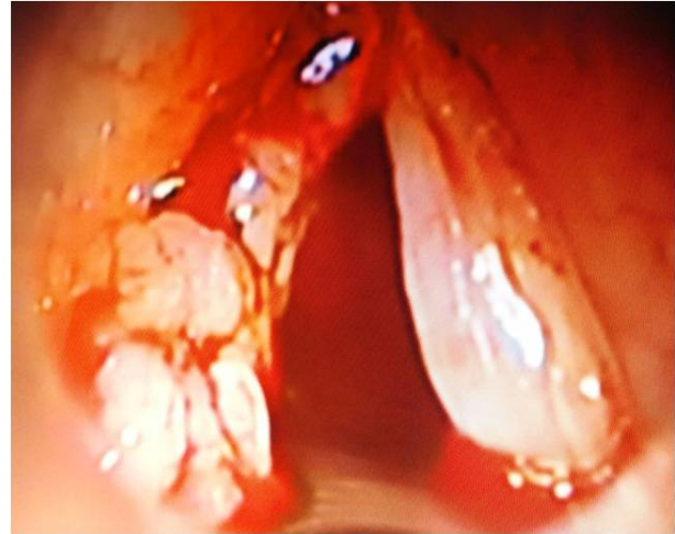
Figure 2. Endoscopic findings before ablation

perform the procedure under local anesthesia like outpatient procedure, which makes them more and more popular methods of removing benign lesions in the larynx.