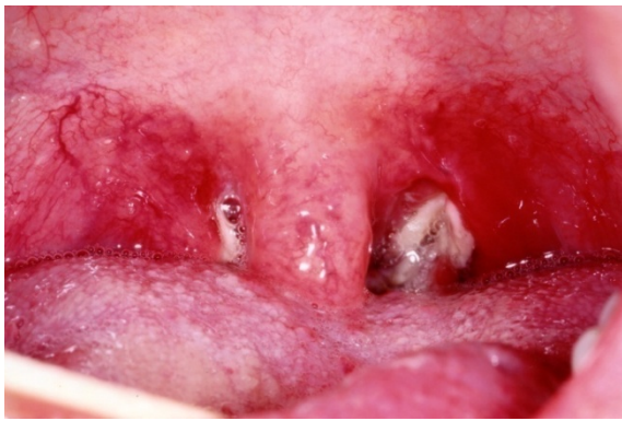
Figure 2. Exudative unilateral tonsillopharyngitis