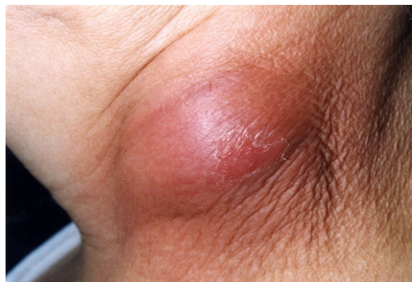
Figure 1. Unilateral suppurative lymphadenitis

The total of 144 patients with differential diagnosis of tularemia were clinically observed, diagnosed and monitored in the interval from 1 to 12 years, since the beginning of 1999 until the end of 2011. In order to definitely confirm the diagnosis of tularemia, the clinical, epidemiological suspicion had to be confirmed by serological immunodiagnostic tests. The clinical criteria included dominant unilateral lymphadenopathy and/or tonsillopharyngitis with fever and possible skin le-