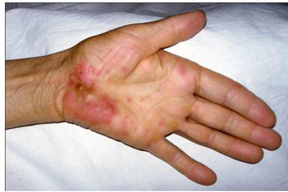
Figure 3. Erythema exudativum multiforme on the palms

sions, mostly on hands and shins. The most frequent clinical form was oropharyngeal (93.8%): with tonsilloglandular (47.8%) and glandular (46%), manifested as a predominant unilateral form (92%).