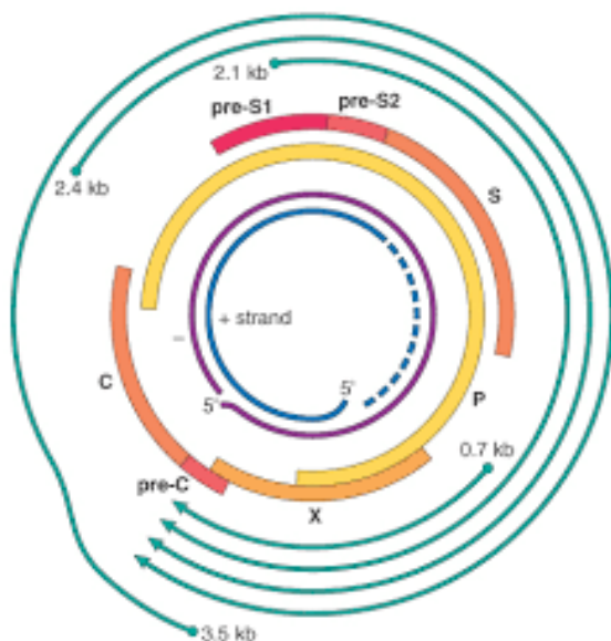
Figure 2. Genome and translation hepatitis B virus structural antigens (HBsAg, HBcAg and HBeAg).

HBV genome codes several polypeptides: viral DNA polymerase, albumin receptors and