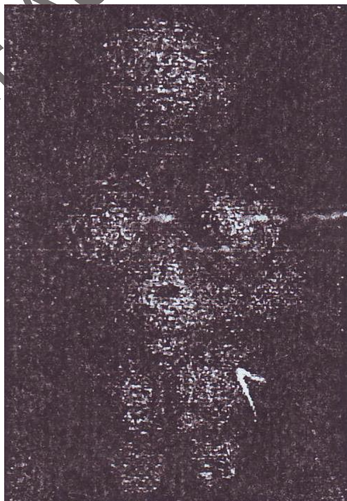
Figure 1. Sculpture of Vennus of Willendorf

It has been suggested that she is a fertility goddess. The figurine known as the Venus of Willendorf is estimated to have been carved around 24000 BC and is considered a forerunner of modern simulation mannequin. This type of figurine is a common art found in sites throughout Eurasia (2).