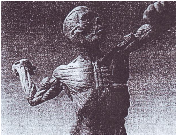
Figure 4 "Ecorche"

Models similar to aforementioned ones, known as 'ecorches', were also made in France. These figures in standing artistic poses showed the bodies without skin, exposing the muscles and blood vessels that were used for medical students' education.