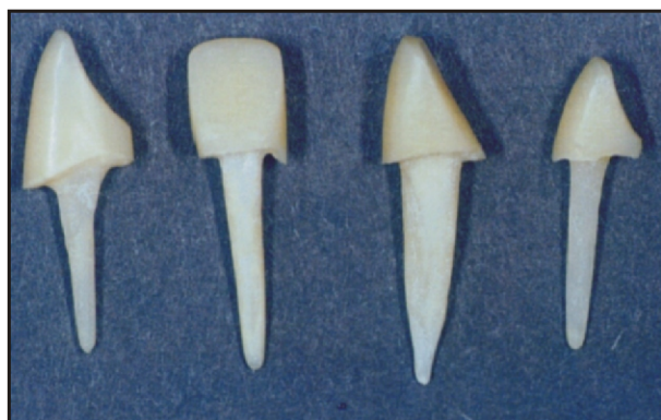
Slika 3. Završeni bezmetalni postovi, uz upotrebu kompozitnih materijala (Vectris i Sr Adoro) Figure 3. Completed fiber-reinforced posts with post build-ups fabricated of composite (Vectris and Sr Adoro)

U cilju postizanja maksimalnog rubnog zaptivanja, patrjci su galvanizovani srebrom. Zahvaljujući probnom modelovanju u vosku, postignut je adekvatan međudnos košuljičnih i