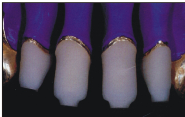
Slika 7. Presovane košuljice IPS Empress 2 na modelu Figure 7. Fitted IPS Empress 2 copings