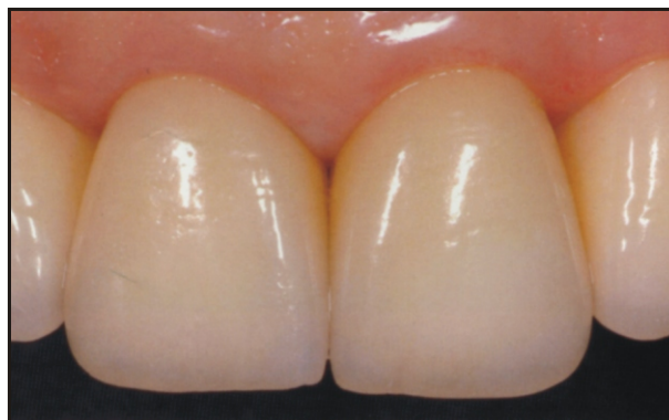
Slika 12. Pogled izbliza na krune nakon šest meseci Figure 12. Detailed picture of the crowns taken during recall after six months

translucency in a convincing fashion. Even the dreaded "black holes" have largely closed since the inflamed gingiva has healed 7 (Fig.12).