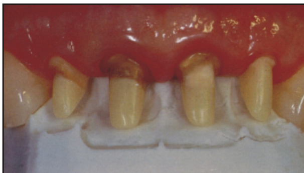
Slika 5. Izgled kanalnih postova nakon cementiranja. Dimenzije se proveravaju prema postojećem silikonskom ključu Figure 5. The root canal posts after cementation. The dimensions of the build-up are checked with the help of the pre-rim.

The crown shapes are layered using the IPS Eris for E2 veneering ceramics. 3 The shade