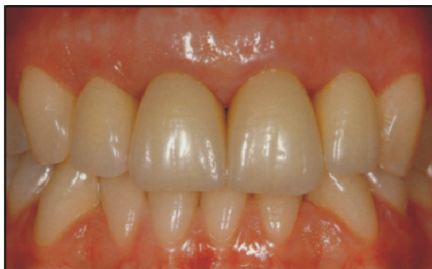
Slika 11. Izgled gotove restauracije Figure 11. Completed crowns

pokazuje i kako se "crni međuprostori" efikasno mogu zatvoriti nakon smirenja inflamacije gingivalnih papila 7 (Sl.12).