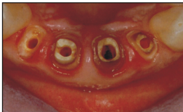
Slika 2. Izgled preparisanih patrljaka Figure 2. Occlusal view of the prepared tooth stumps

After successful completion of the endodontic treatment, and once the gingiva has completely healed, the four tooth stumps are prepared to accommodate the prosthetic restoration (Fig. 2). The preparation should