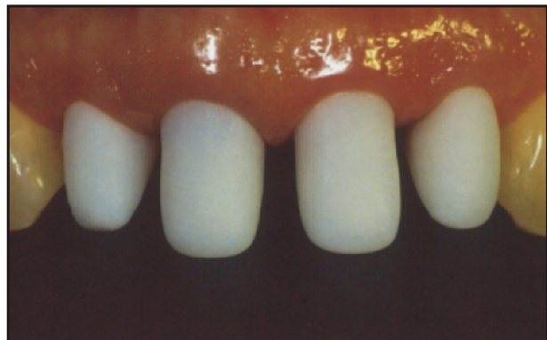
Slika 8. Proba košuljice u ordinaciji Figure 8. Try-in of the copings