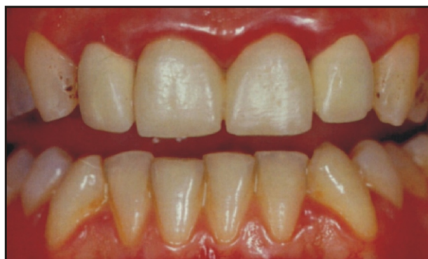
Slika 1. Izgled pacijenta na početku Figure 1. Starting situation

Nakon uspešnog završetka endodontske terapije i potpunog smirenja svih znakova zapaljenja, pristupili smo preparaciji zuba za prihvatanje bezmetalnih keramičkih kruna (Sl. 2). Preparacija mora zadovoljiti principe otpo-