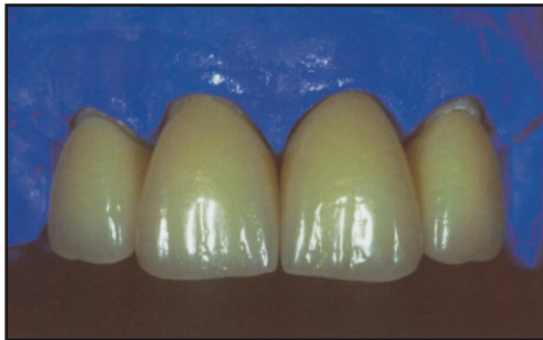
Slika 9. Gotove krune na modelu Figure 9. Completed crowns on the model

Cementiranje je veoma važan korak. Preporučuje se upotreba koferdama kada se koriste novi, adhezivni cementi poslednje generacije (Variolink II, IVOCLAR-VIVADENT, Schaan, Liechtenstein (Sl. 10).