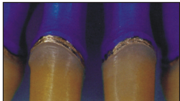
Slika 6. Pogled izbliza na marginalu adaptaciju Figure 6. Close-up of the marginal seal