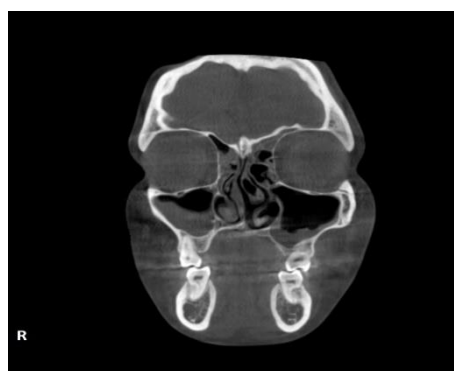
Slika 5: Koronalna CBCT slika, koja prikazuje odstupanje nosnog septuma i nerazvijenu desnu nosnu šupljinu, hipoplastičnu desnu stranu maksilarnih i etmoidalnih sinusa, sa delimičnim zamućenjem

Figure 4: 3D Reconstruction demonstrating the defect in the frontal bone