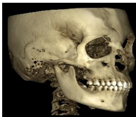
Slika 4: 3D rekonstrukcija, koja pokazuje defekt na čeonj kosti

Figure 3: Clinical picture showing marked alopecia