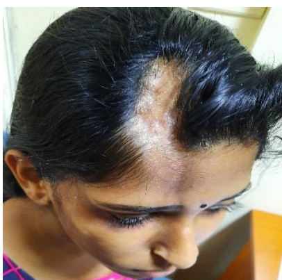
Slika 3: Klinička slika, koja pokazuje izraženu alopeciju

Figure 2: Right lateral view of the face showing a defect in the frontal region extending to the lateral part of nasal cavity