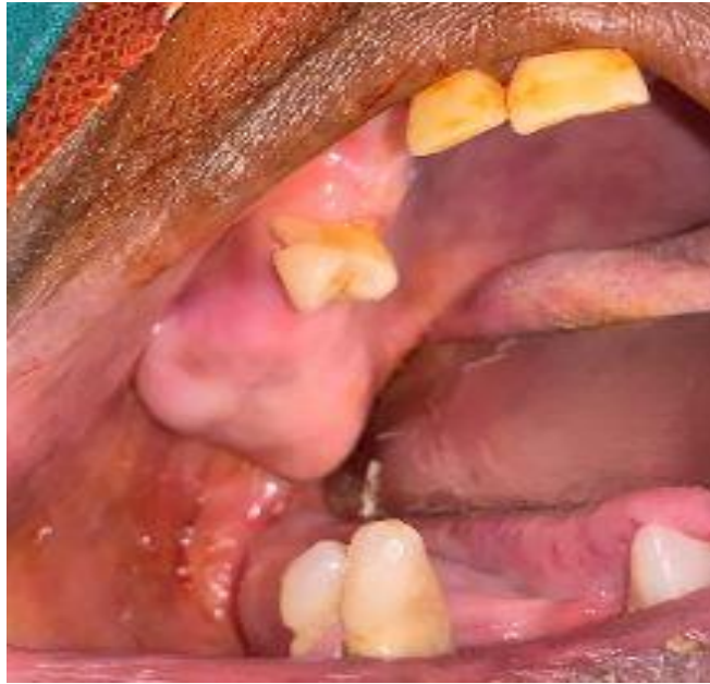
Slika 1: Klinička slika pokazuje leziju u desnoj alveoli gornje vilice koja se proteže medijalno do bukalnog korteksa, lateralno do nepca, a posterijorno dostiže do tubera maksile