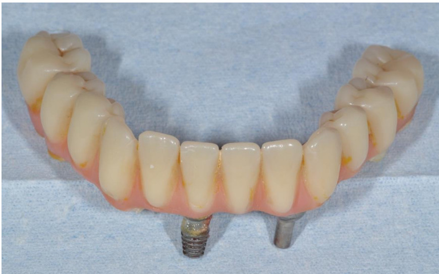
Slika 4. Pacijent 2: Klinička fotografija kompletno uklonjene proteze sa pričvršćenim neuspelim implantom Figure 4. Patient 2, clinical photo of the prosthesis removed in its entirety, with the failed implant attached