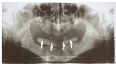
Slika 1. Pacijent 1: četvorogodišnje praćenje Figure 1. Patient 1, four-year follow-up

Žena stara 70 godina javila se na kliniku zbog krvarenje gingive, pokretljivosti proteze i bola tokom žvakanja. Kliničkim pregledom uočeni su upala gingive i lokalni bol. Ortodontomografijom otkrivena je periimplantna radiolucencija, lokalizovana na implantatima postavljenim na mestima 33 i 41. Nastavili smo sa uklanjanjem proteze (implantat na mestu 41 sam je ispao tokom ove procedure; videti Sliku 4) i zabeležili kliničku pokretljivost dva implantata. Imajući u vidu lokalne uslove, uklonili smo dva implantata postavljena na mestima 33 i 42 (Slika 5) i ponovo prilagodili postojeći okvir lokalnim uslovima. Ostala tri implantata (43, 45 i 35) popustila su u narednim mesecima.