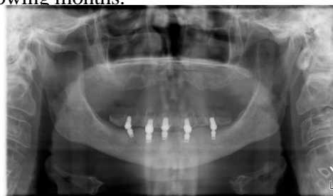
Slika 2. Pacijent 2: petogodišnje praćenje Figure 2. Patient 2, four-year follow-up

A 70-year-old woman presented with gingival bleeding, prosthesis mobility and pain during the mastication. By clinical examination, we detected gingival inflammation and local pain. The orthopantomography revealed a peri-implant radiolucency localized to the implants placed in sites 3.3 and 4.1. We proceeded to remove the prosthesis (the implant in site 4.1 removed itself during this procedure, see Figure 4) and recorded the clinical mobility of the two implants. Considering the local conditions, we removed the two implants placed in sites 3.3 and 4.2 (Figure 5) and readapted the existing framework to local conditions. Other three implants (4.3, 4.5 and 3.5) failed in the following months.