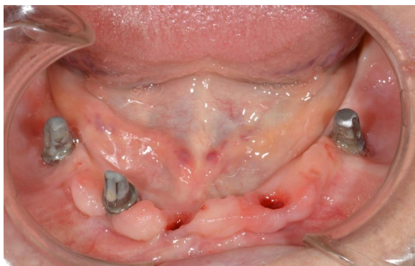
Slika 5. Pacijent 2: Klinička fotografija dobijena tokom uklanjanja implantata Figure 5. Patient 2, Clinical photo obtained during implant removals

After three months, implants were surgically exposed and the healing abutments were applied. Two weeks later, a full arch polyvinyl siloxane impression of the implants and the opposing teeth was taken. The prosthesis was cemented using a temporary luting agent (Temp Bond NE, Kerr). Then, the control of the occlusion was performed.